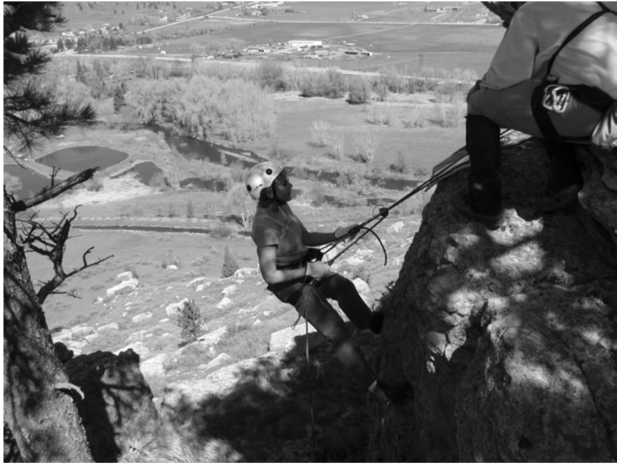
Well, I did it too!!!