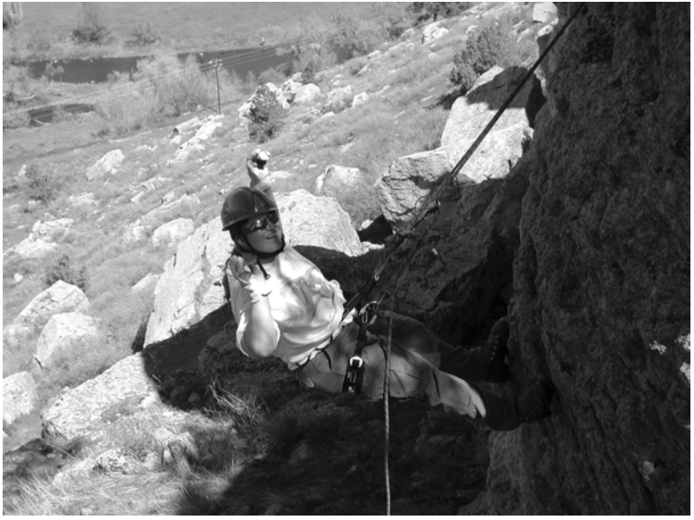
Yeah!!! I did it.